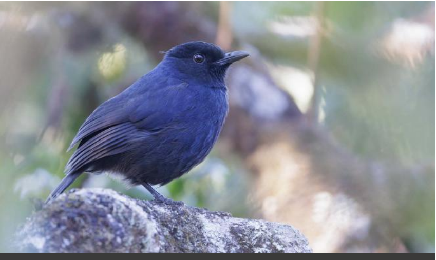
Sri Lanka Whistling Thrush is one of the more range-restricted endemics, being found almost exclusively at higher elevations. This fine male was seen at Horton Plains NP.

views of this secretive bird, plus other tricky targets including Sri Lanka Thrush, Sri Lanka Bush Warbler and the harshly named Dull-blue Flycatcher, as well as a spectacular sunrise on the way up.