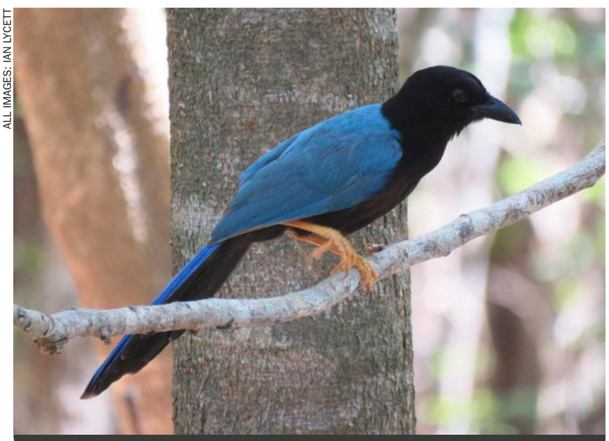
The noisy, gregarious and colourful Yucatán Jay is endemic to the Yucatán Peninsula. It is rather commonly encountered as birds rove around in large groups.

Walking the track along the side of the lake and then into the small adjacent village, we picked up a host of species for the list. A particularly showy pair of Turquoise-browed Motmots were clearly nesting in a partially constructed building – an ideal substitute for their traditional nest sites in caves – and afforded excellent