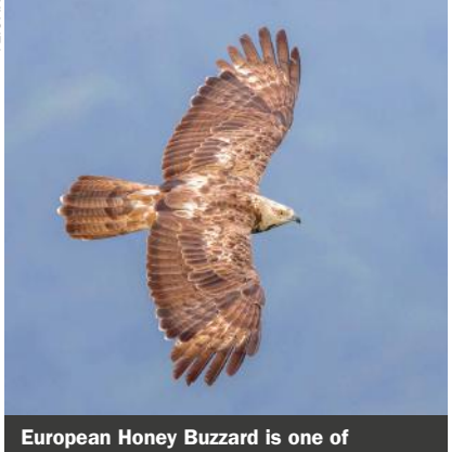
the most numerous migrating raptors encountered in the autumn at Batumi.

Raptors leaving northern Europe and Russia each autumn are funnelled along the Lesser Caucasus mountains and onto the coastal strip next to the Black Sea at Batumi. The dedicated Batumi Raptor Count runs from mid-August through to late October each year and the annual