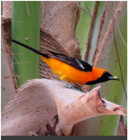
Hooded Orioles provided plenty of colour and entertainment from the breakfast area at the author's hotel.

views. This species is my favourite member so far of an attractive family and is certainly well named.