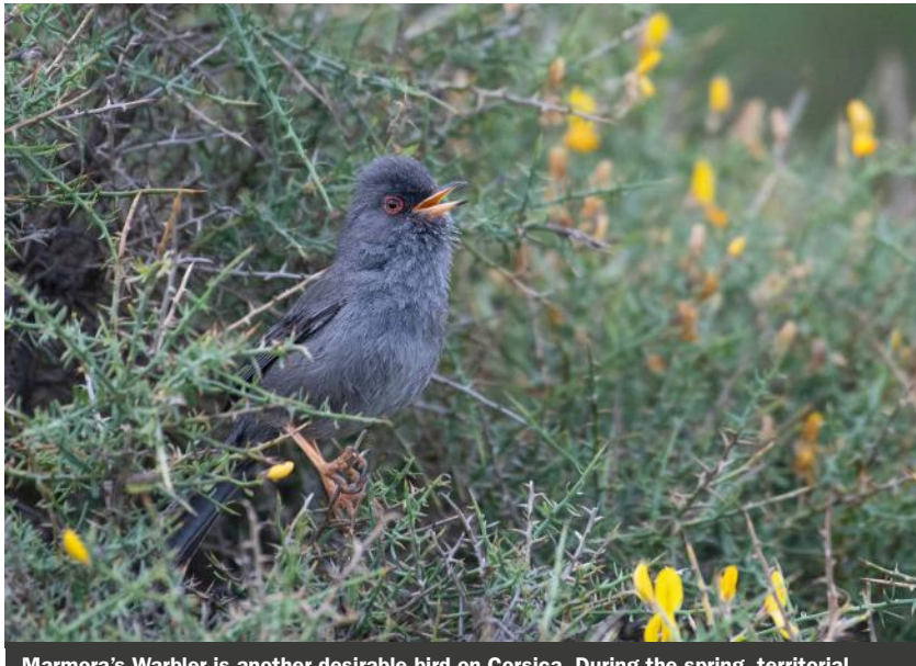
Marmora's Warbler is another desirable bird on Corsica. During the spring, territorial males can be particularly vocal and showy.