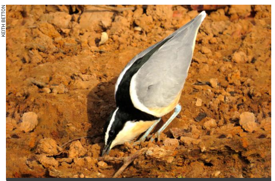
Egyptian Plover is an ornate-looking wader found in sub-Saharan Africa, from Senegal in the west to Ethiopia in the east. Despite the name, it no longer occurs in Egypt.

It is by far one of the most striking birds in Africa and was chosen as the emblem of the African Bird Club. You may see an alternative name of 'Crocodile Bird' in some old books, on the basis that it has been reported to pick insects from the mouths of basking crocodiles. As far as I know there is no truth in that story. Its method of nesting involves digging a scrape on a river sandbar and leaving the eggs partially buried to avoid them becoming too hot. It will also cool the nest by transferring water from its belly feathers. This is without doubt my favourite of the birds featured in this article!