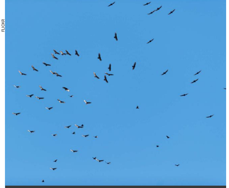
Masses of migrating Turkey Vultures are among the raptor spectacles on show at Veracruz in Mexico, which is one of the best places to observe bird of prey passage in the world.

Here, Europe and Africa are separated by only a narrow stretch of water. This means that the area is used as a migration flyway by thousands of raptors twice every year. March, April and May witness the surge northwards as birds hurry back to their breeding grounds. Autumn migration is particularly good for raptors from late August through to mid-October. A peak day may see several thousand Black Kites and European Honey Buzzards, 1,000 Booted Eagles, hundreds of Shorttoed Snake Eagles and thousands of storks pass through. Vultures also feature, with some 3,000 Egyptian and 10,000 Griffon Vultures recorded each season, the latter sometimes being accompanied by the rare Rüppell's Vulture. There are several watchpoints along the Iberian side of the strait. Tarifa is best during a spell of easterly winds, while Punta Carnero and the Rock of Gibraltar at the eastern side are best in a westerly.