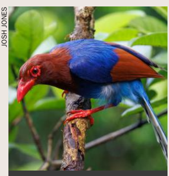
Sri Lanka Blue Magpie is one of the key species on our tour to its namesake island.

Madeira, with many seabird and cetacean species possible, including Zino's Petrel, White-faced Storm Petrel and Boyd's Shearwater, as well as the chance of a major regional rarity if we are lucky. In addition, Raso Lark will be looked for during a zodiac trip around its namesake island.