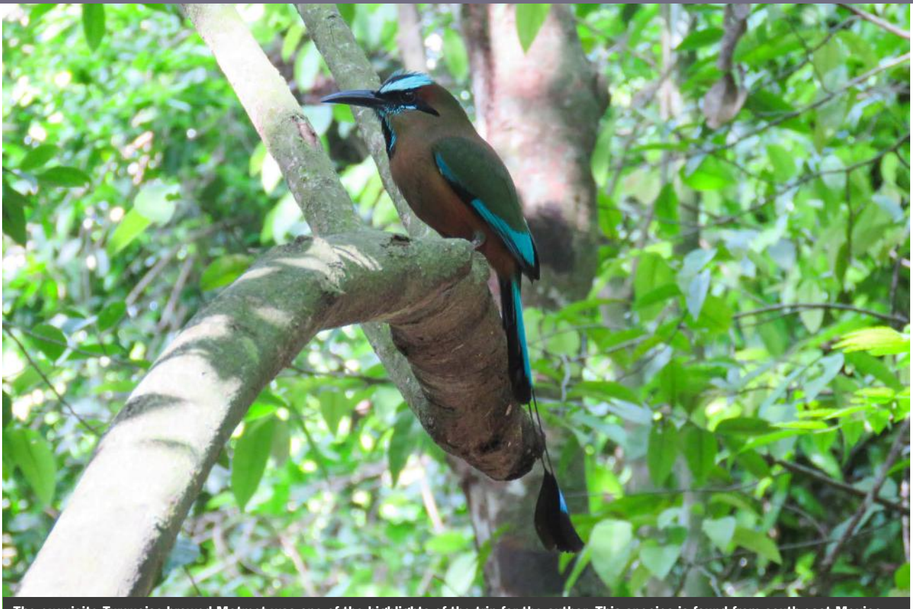
The exquisite Turquoise-browed Motmot was one of the highlights of the trip for the author. This species is found from south-east Mexico through Central America south to Costa Rica, often in fairly open habitats such as forest edge, scrubland and agricultural land.