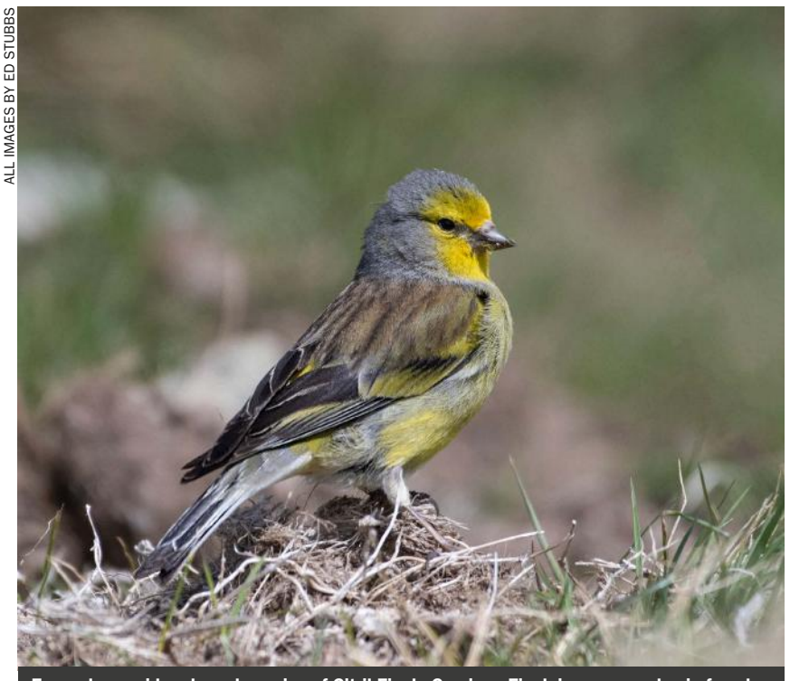
Formerly considered a subspecies of Citril Finch, Corsican Finch is a near-endemic found only on Corsica, Sardinia and a handful of other small islands.

Further north along the coast lies Étang de Biguglia – Corsica's largest