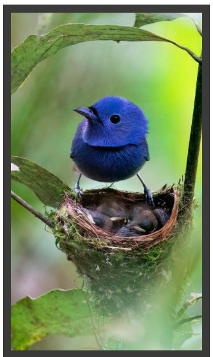
Black-naped Monarch is a stunning passerine found widely across tropical Asia. This male was photographed at its nest by a trail at Sinharaja rainforest.

All too soon, our time in Sri Lanka was at an end. It had been an actionpacked trip with phenomenal wildlife enjoyed along the way. A total of 225 bird species was amassed, including all 34 of the currently recognised endemics – full credit to the expertise of our guide, Susa. With brilliant views of Fishing Cat, Leopard and the ever-entertaining Asian Elephant, as well as visiting some incredible places and eating the wonderful Sri Lankan cuisine, it was a trip I'll never forget – and I couldn't recommend it highly enough as a destination.