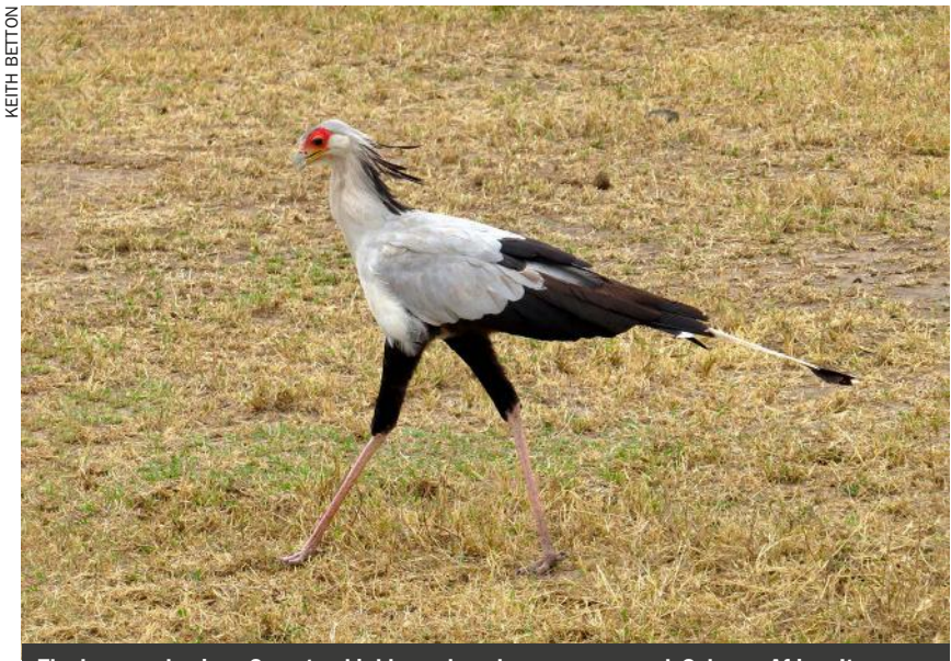
The large and unique Secretarybird has a broad range across sub-Saharan Africa. It appears on the coats of arms of both Sudan and South Africa.