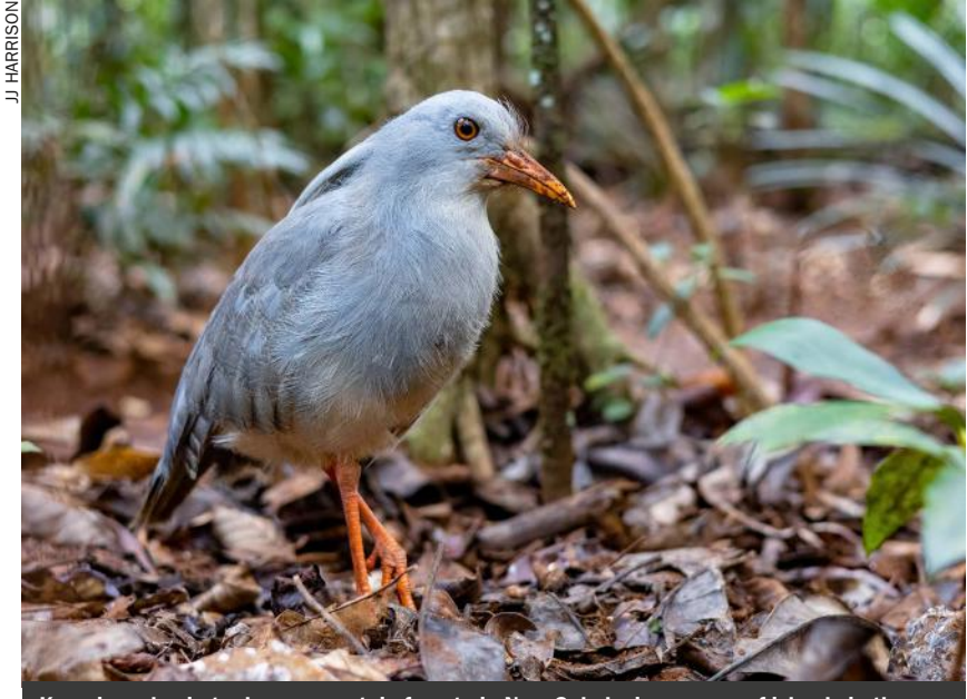
Kagu is endemic to dense mountain forests in New Caledonia, a group of islands in the south-west Pacific Ocean. It is the only surviving member of the family Rhynochetidae.

While some of the families I am looking at are restricted to a relatively small area, Osprey is widespread and one of only six landbird species that occur on every continent except