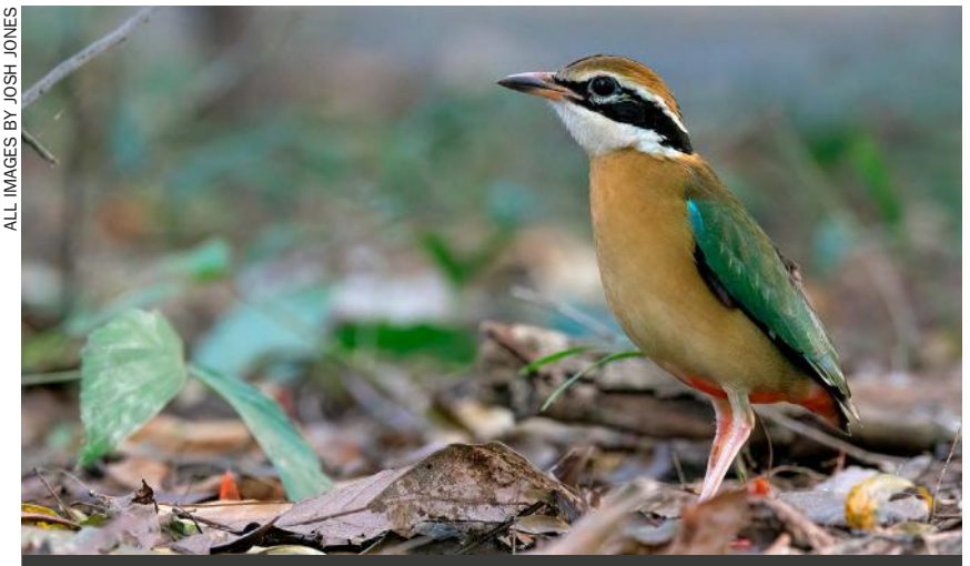
As well as boasting plenty of endemics, Sri Lanka attracts wintering species from further north. Among them is the stunning Indian Pitta, which can give great views with patience.

From a birder's perspective, a visit to this area is essential to connect with one of the country's rarest endemics – Sri Lanka Whistling Thrush. An early morning visit to Horton Plains NP saw us secure great