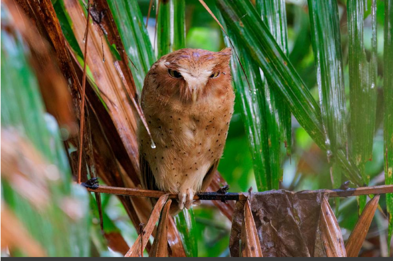
Described as a species new to science as recently as 2004, Serendib Scops Owl is a major target for birders visiting Sri Lanka. It is found only in the country's southern rainforests and is currently listed as Endangered by IUCN. This soggy individual was one of a pair enjoyed after a massive thunderstorm at Sinharaja one afternoon.