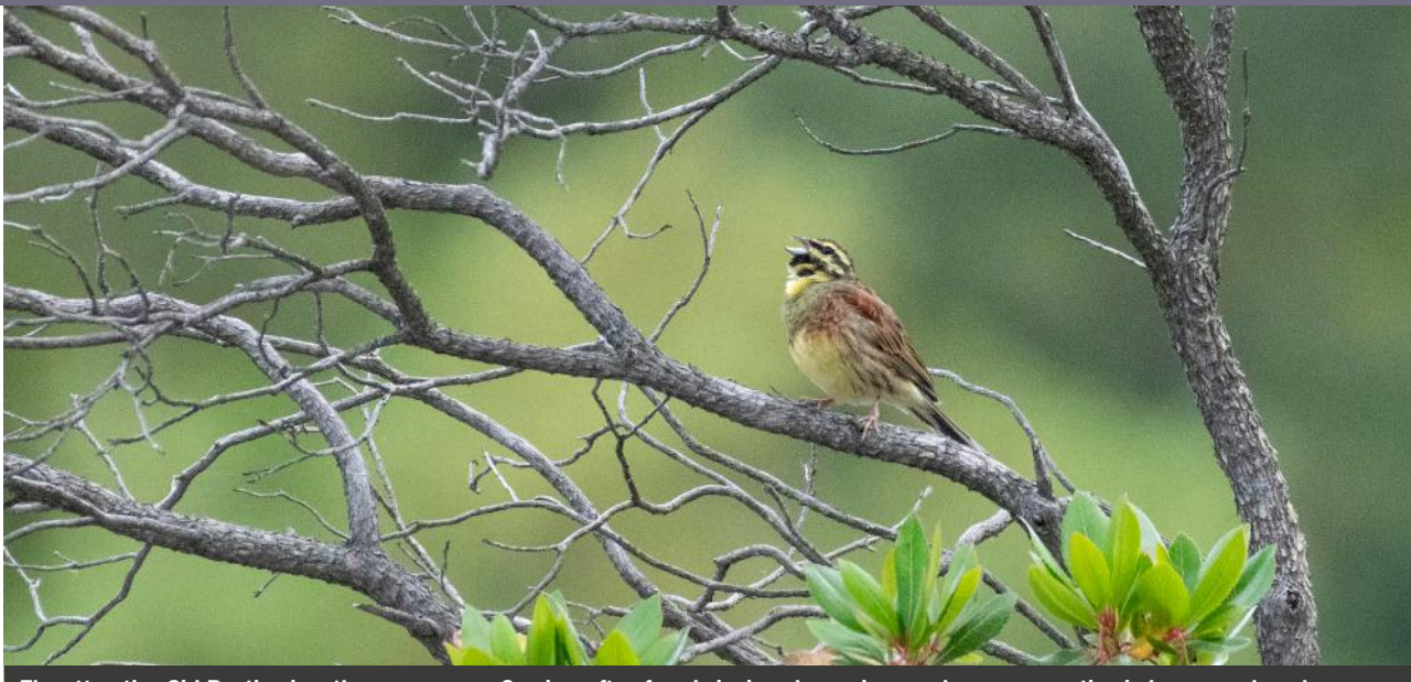
The attractive Cirl Bunting is rather common on Corsica, often found singing along minor roads or even nesting in larger rural gardens.

my targets. It has a well-established population along the island's east coast but nowadays is hard to see. However, the relatively new stakeout at Riva Bella has been reliable in recent years and on my visit I was lucky to score four birds while in the good company of some Swedish birders. Surprisingly, a male quail even sat up in a tree for good measure.