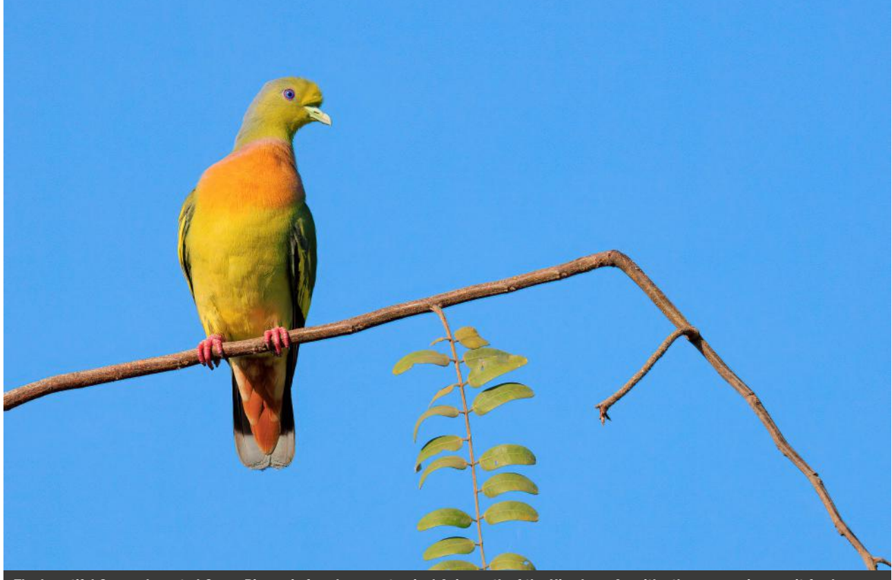
The beautiful Orange-breasted Green Pigeon is found across tropical Asia south of the Himalaya. As with other green pigeons, it feeds mainly on small fruit. It is widespread and relatively easy to see in Sri Lanka, sometimes alongside the endemic Sri Lanka Green Pigeon.

never forget as he ambled down the track towards our truck, offering some brilliant photo opportunities.