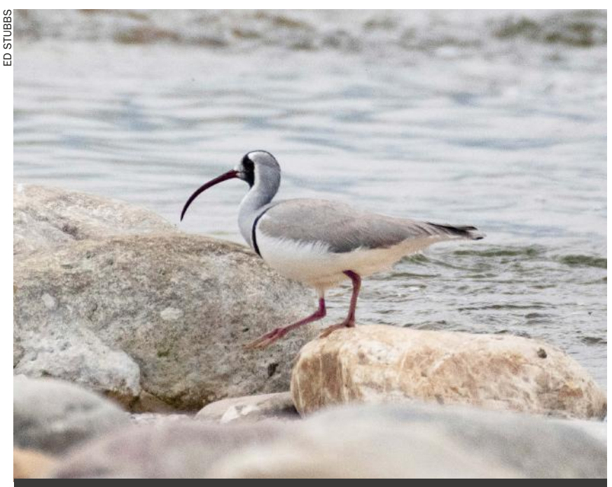
Ibisbill is related to the shorebirds, but sufficiently distinctive to merit its own family, Ibidorhynchidae. It is found on high-elevation rocky rivers of Central Asia and the Himalaya.