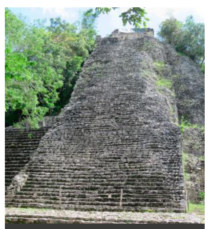
The impressive Maya ruins at Coba were a sight to behold – and also offered highquality birding opportunities.

The surrounding forest here is very thick, so one of the easiest ways to get into it without becoming lost is to visit the Maya archaeological sites. Coba was the site of an extensive Maya city. At its peak, it is estimated that up to 50,000 people lived there. Abandoned in around 1500AD, it was subsequently reclaimed by the jungle. With only a few key buildings