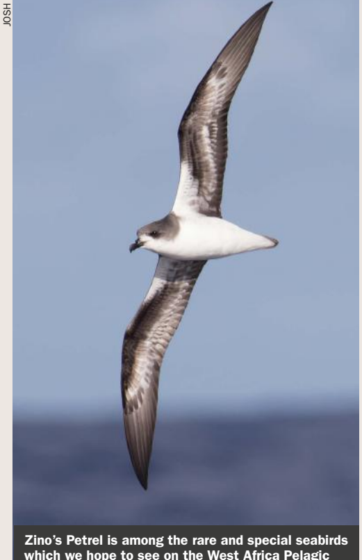
which we hope to see on the West Africa Pelagic in early May 2026.

has a range of very varied and exciting habitats to explore and some equally exciting bird species to find. Our trip here in February 2026 has the promise of such avian gems as Wallcreeper, White-winged Lark, Caspian Tit, Güldenstädt's Redstart, Caucasian Snowcock and Pallas's Gull.