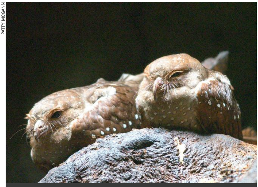
Nesting in colonies in caves, Oilbird is nocturnal and feeds on the fruits of oil palm and tropical laurels. It is the only nocturnal flying fruit-eating bird in the world.

Oilbirds leave their caves at night and travel large distances to find fruit. The birds are thought to use their keen sense of smell to locate fruit, but possibly also to navigate back to their caves. However, just like bats, they rely partly on echolocation and use a series of audible clicks, with each bird in a group clicking at slightly different frequencies. In addition, they have amazing night vision that is better than even some owls. Although people have been tempted to lump Oilbird in with nightjars, it is now broadly accepted that it constitutes a family in its own right.