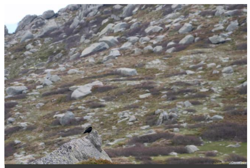
Corsica's higher peaks hold an impressive range of montane species not typically associated with the Mediterranean, including Alpine Chough.

This, coupled with spectacular scenery, easy birding away from crowds and in quiet locations, excellent food and typically Mediterranean weather, made it a destination that was hard to find a fault in. Indeed, the only downside was the brevity of my visit – but I made a promise to myself that I would one day return to the mountains of the Med, for there is so much more to explore in this wonderful – and perhaps somewhat underrated – European birding destination.